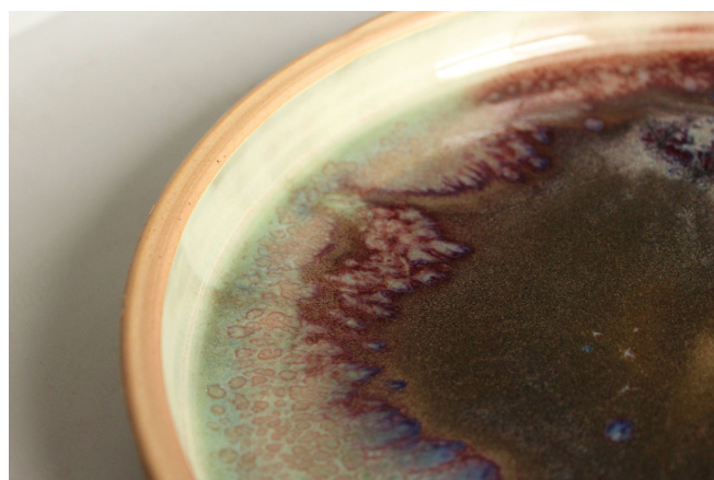
Above & Left: Some of the pots from the firing.